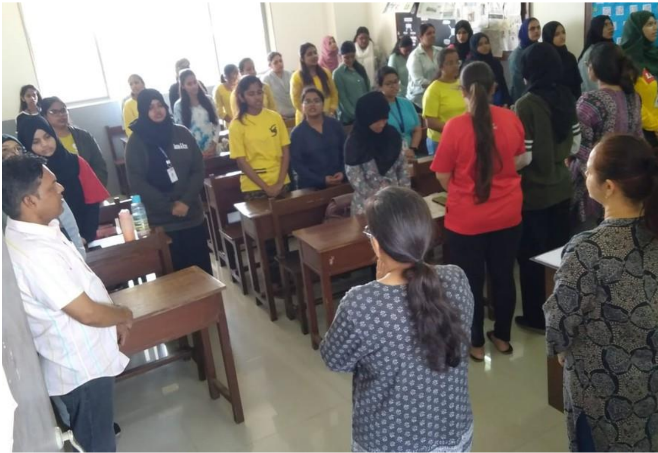
Figure 1 assembly

The sports day kicked off with a college prayer, followed by the national anthem. Subsequently, students in F.Y. B.Ed and S.Y. B.Ed were instructed to arrange themselves according to their respective house colors, which included red, green, blue, and yellow. Each student was required to participate in at least two games and provide their names to their house captain, indicating their preferred games. Following this, the Carrom, Sudoku, and Chess matches commenced simultaneously, with students divided into two groups for each game, and two rounds were played for each activity. Additional instructions were provided for other games, such as Sudoku, Chess, Hula Hoop, Skipping, and Kickball, which were played in various classrooms and areas across the college campus.