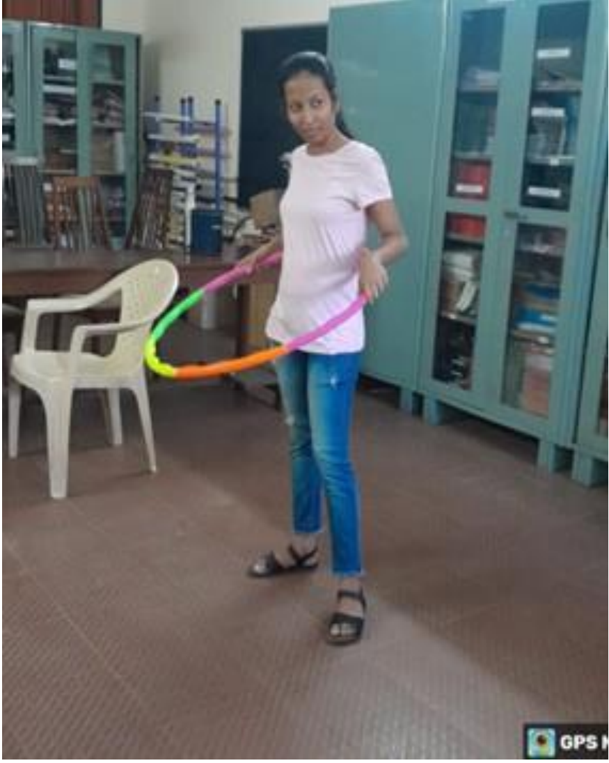
Figure 3 HULA HOOP

As the student teachers eagerly anticipated the outdoor games to follow, they carried with them the memories of a memorable day filled with sportsmanship, teamwork, and unforgettable experiences.