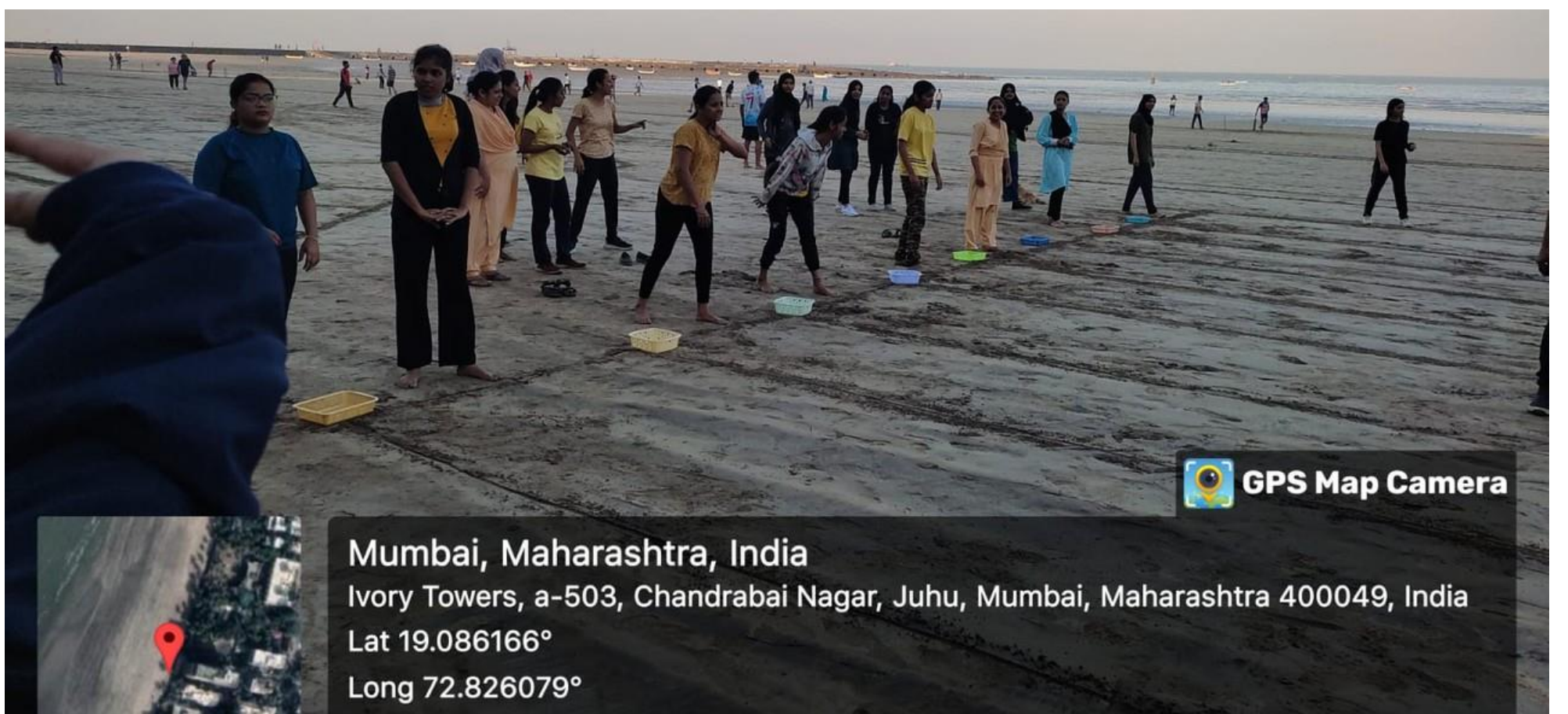
Figure 5 POTATO RACE