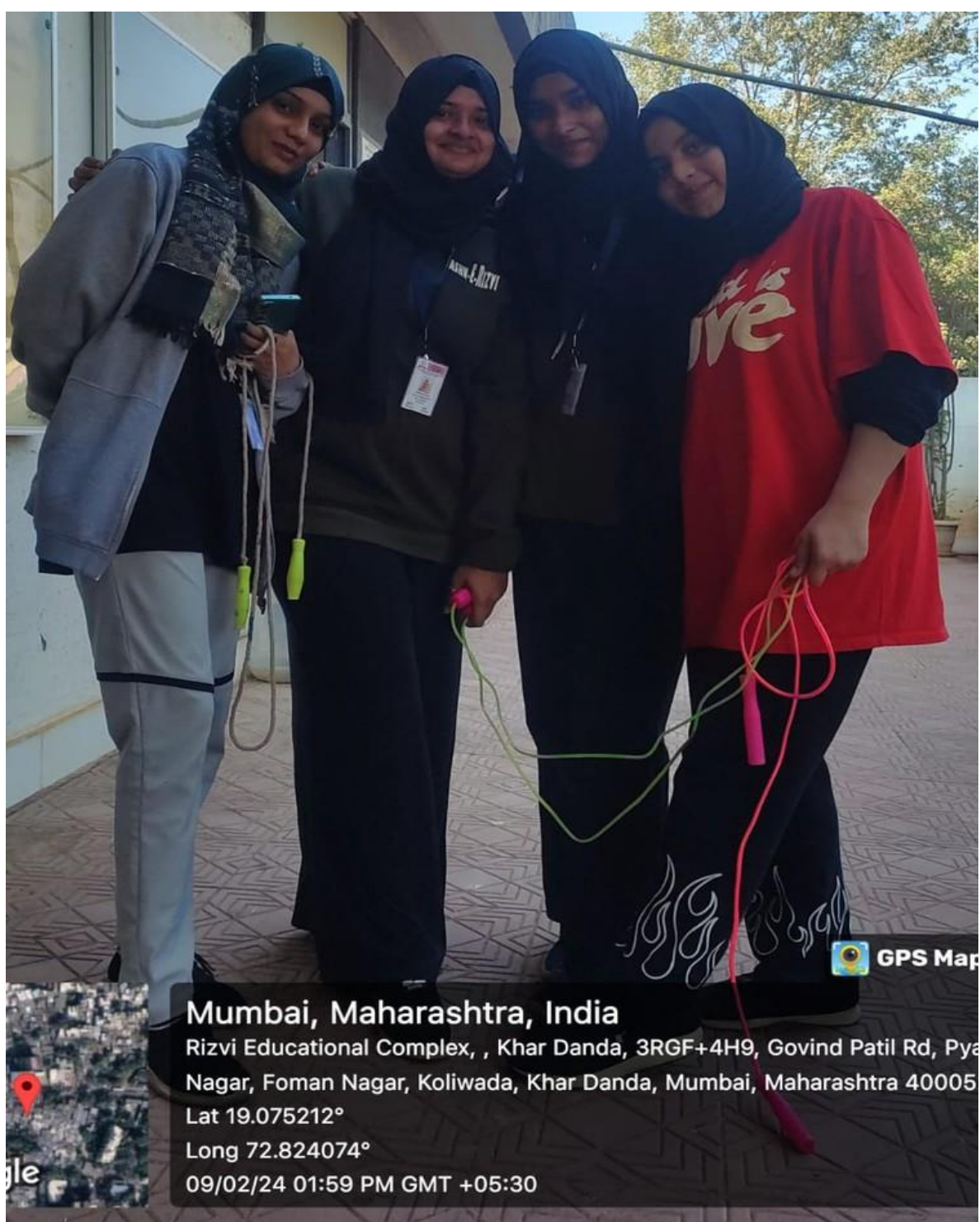
Figure 2 SKIPPING