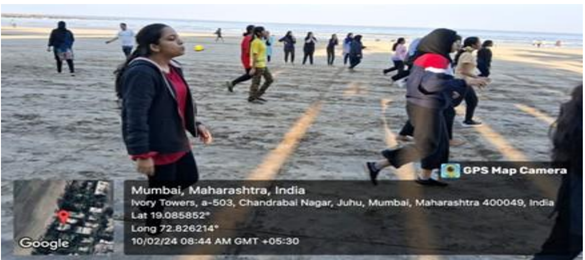
Figure 6 LEMON AND SPOON RACE