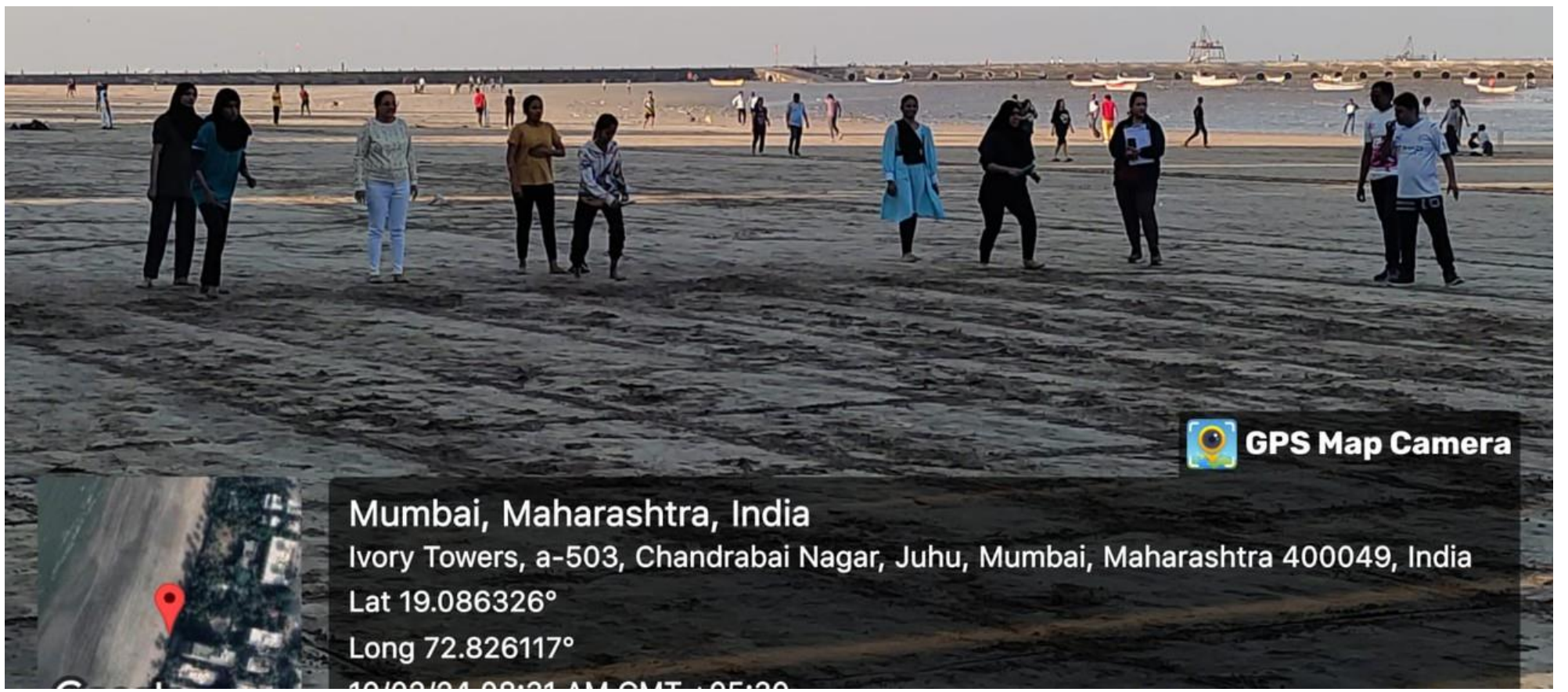
Figure 4 RELAY RACE